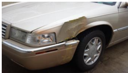
Current estimate $2,400.