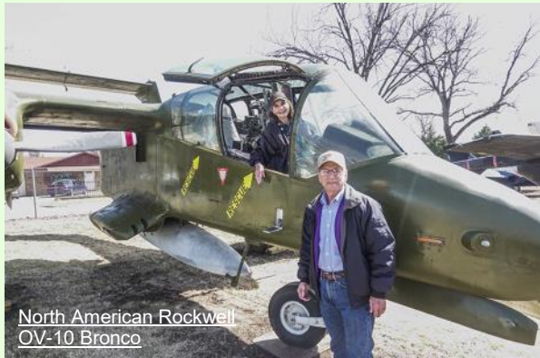
North American Rockwell OV-10 Bronco