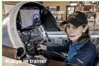
Ruby in trainer